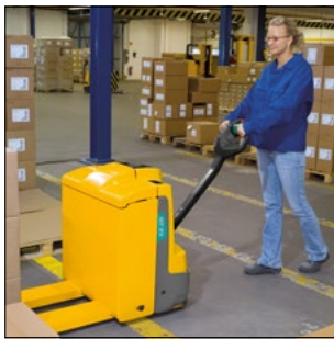
Application in block warehouse