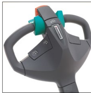
Ergonomic tiller arm