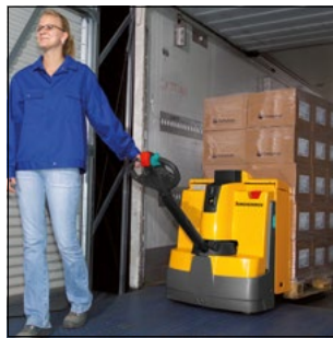
The EJE unloading an HGV