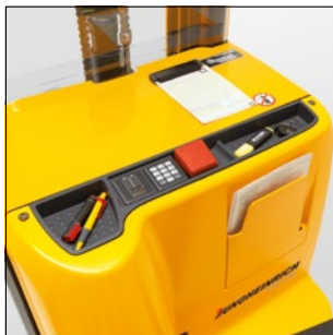
Plenty of storage options to keep important items close to hand