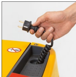
Built in charger cable and plug