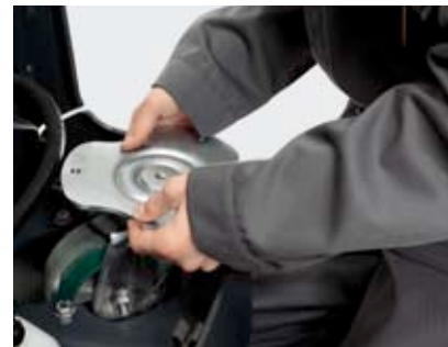
Castor wheel is easy to replace, which lowers maintenance costs