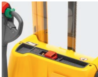
Good storage options for pens, tools and documents